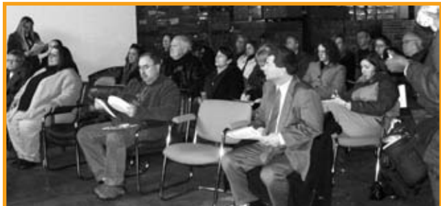
Thirty people turned out for Shared Harvest's Community Conversation on Ohio's budget crisis.