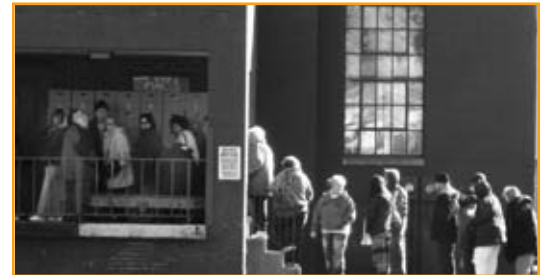
Senior citizens and families in Franklin line up outside Franklin Area Community Services on a cold January day.