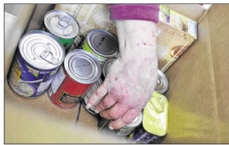
Debbie Houston at Shared Harvest FoodBank in Fairfield places food in a box to be delivered to a food pantry.